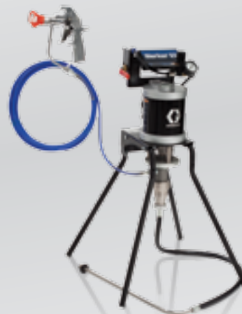
30:1 airless stand mount