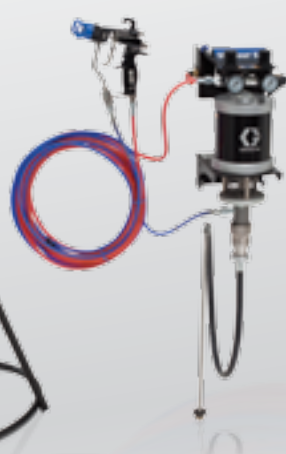
30:1 air-assist wall mount