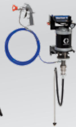
30:1 airless wall mount