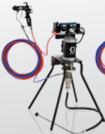
15:1 air-assist stand mount