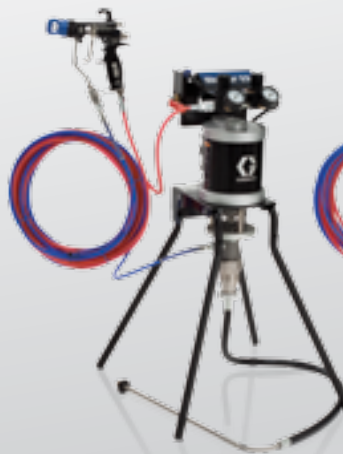
30:1 air-assist stand mount