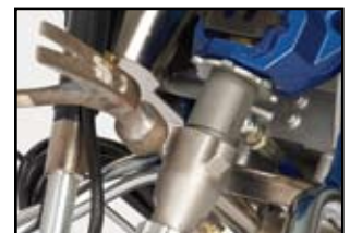
QuikAccess intake requires only a hammer to access the intake ball.