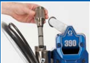
New Easy Out Filter with 8.1 square inches of filtering area.

Comes complete with: New FTX™ Gun, RAC-X 515 Tip and Guard, 1/4 in x 50 ft (6.4 mm x 15 m) BlueMax™ II Hose.