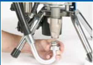
No tools suction hose removal.

Comes complete with: New Contractor Gun, RAC X 517 Tip and Guard, 1/4 in x 50 ft (6.4 mm x 15 m) BlueMax II Hose.