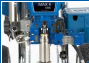
Watchdog Pump Protection System prevents dry pumping damage.