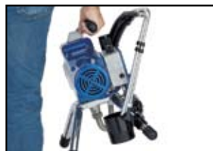
Offset handle for comfortable carrying.

Comes complete with: New Contractor Gun, RAC X 517 Tip and Guard, 1/4 in x 50 ft (6.4 mm x 15 m) BlueMax II Hose.