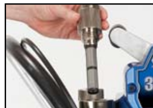
Easy Out pump filter removes simply with the cap.