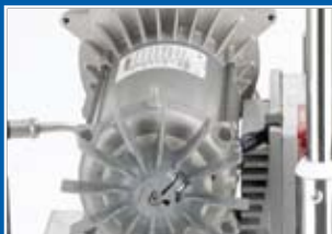
Brushless DC motor with Lifetime Warranty.