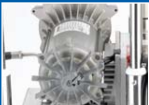
Exclusive ProConnect System - no-tools removal for fast repairs on the job.

All units include Contractor Gun, 1/4 in x 50 ft BlueMax II Airless Hose, RAC X 517 Tip and Guard Premium versions include Digital Display, AutoClean2, and Toolbox.