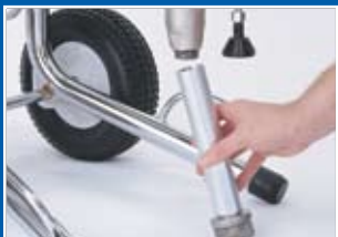
Swivel inlet suction hose.

All units include Contractor Gun, 1/4 in x 50 ft BlueMax II Airless Hose, RAC X 517 Tip and Guard. Premium versions include Digital Display, AutoClean2, and Toolbox.