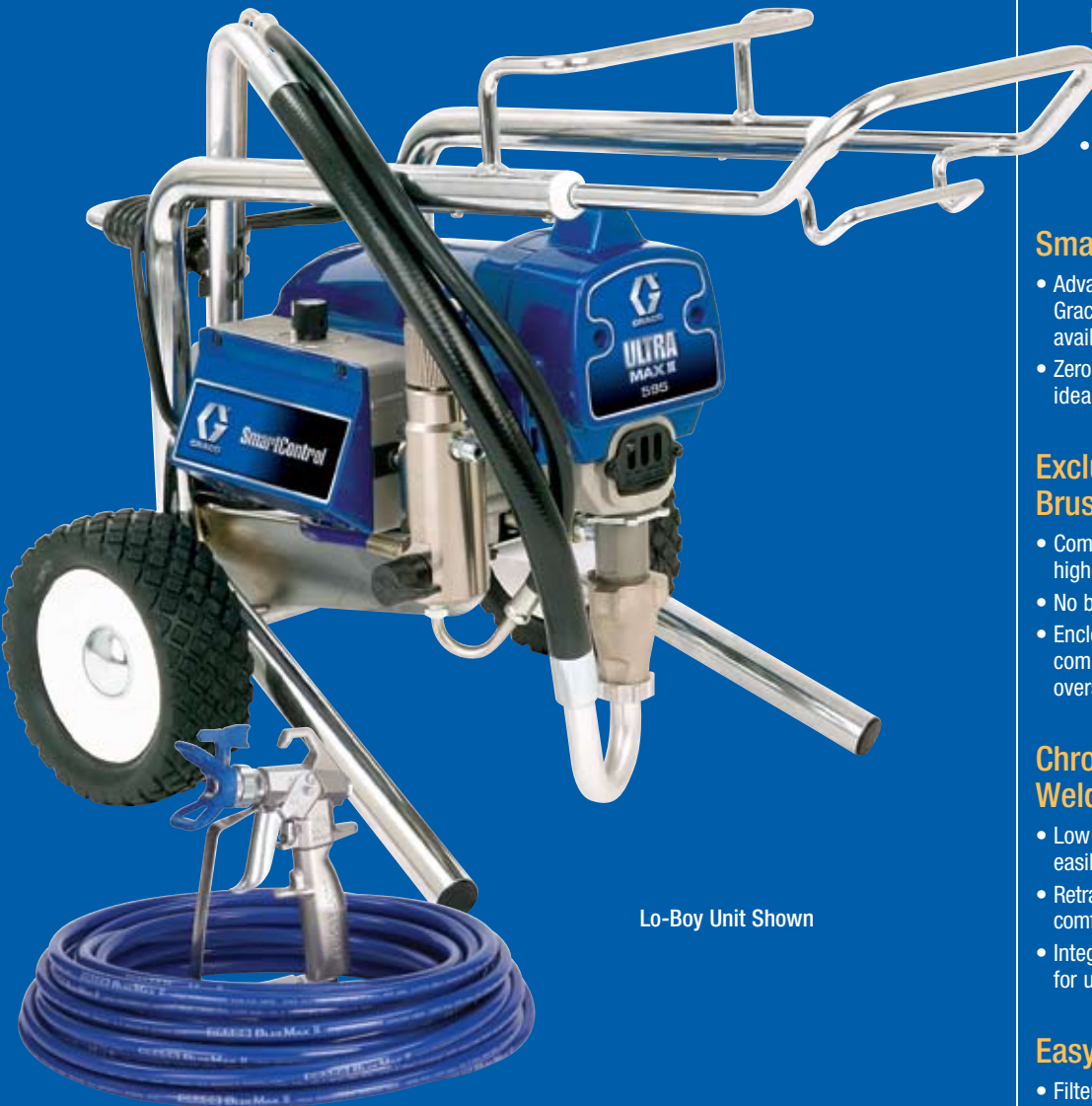
Lo-Boy Unit Shown