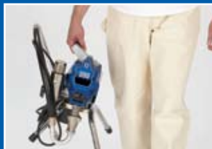
New offset handle is positioned to kick sprayer away from leg while carrying.