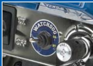
Watchdog Pump Protection System prevents dry pumping damage.