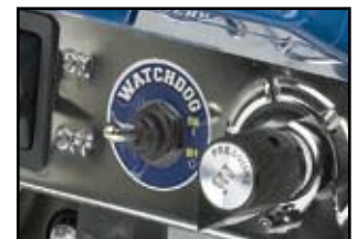
WatchDog Pump Protection System prevents dry pumping damage.