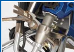
New QuikAccess™ intake requires only a hammer to access the intake ball.