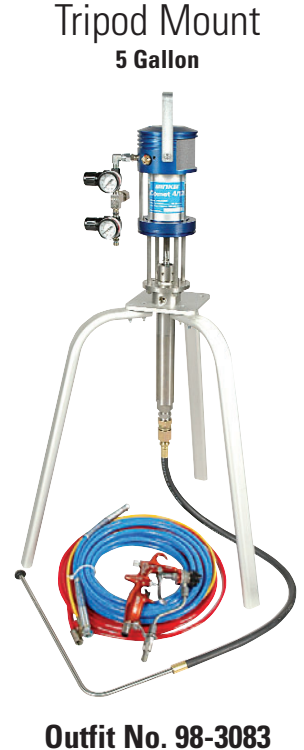
Specify tip at time of order (see page 4)

Outfits include: Comet 4/12 Pump, AA1500 Spray Gun with A10 Air Cap, air hose, fluid delivery hose, 5 ft. whip end, air regulators for atomizing and pump.