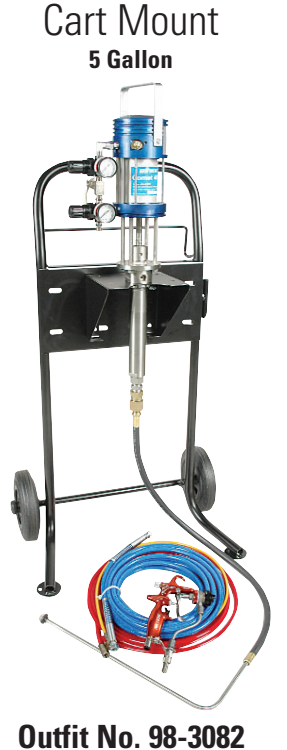
Specify tip at time of order (see page 4)