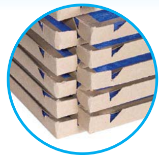
Notched Frame Design