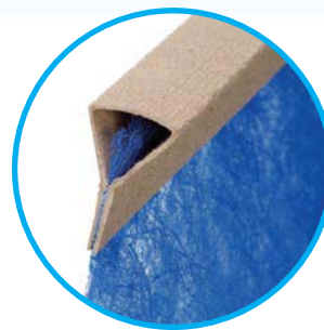
Pinch Frame Design