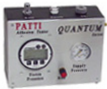
SEMico Patti Quantum

The most widely-used instrument for evaluating coatings for scratch adhesion & mar resistance.