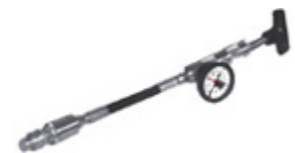
Hydraulic Adhesion Tester

This instrument will test the adhesion and brittleness of dry coats of paint on their substrate by means of a set of six circular blades and two guide blades.