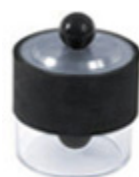
Wet Tape Test Roller

The Scratch, Adhesion and Mar Tester is the paint chemist's "educated knife". A pocket size universal instrument loading handle for measuring.