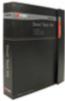
Dust Test Kit

An ergonomic test kit to assess the quantity and size of dust particles on blast cleaned surfaces prior to painting.