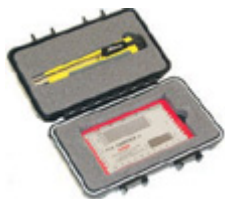
Gardco Temper II Gauge

Spring Loaded Roller Apparatus for Cleanliness Tape Test ISO 8502-3 as mentioned in Procedure 6.2b.