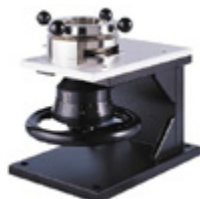
PA-760 Cupping Tester

A handy new stainless steel tool template which allows you to use all the popular crosscut spacing's, 1, 1.5, 2, and 3mm, in one unit.