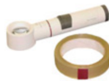
Surface Cleanliness Test

Paint Adhesion Test Kit that contains the tools & materials needed for conducting adhesion tests on paints.